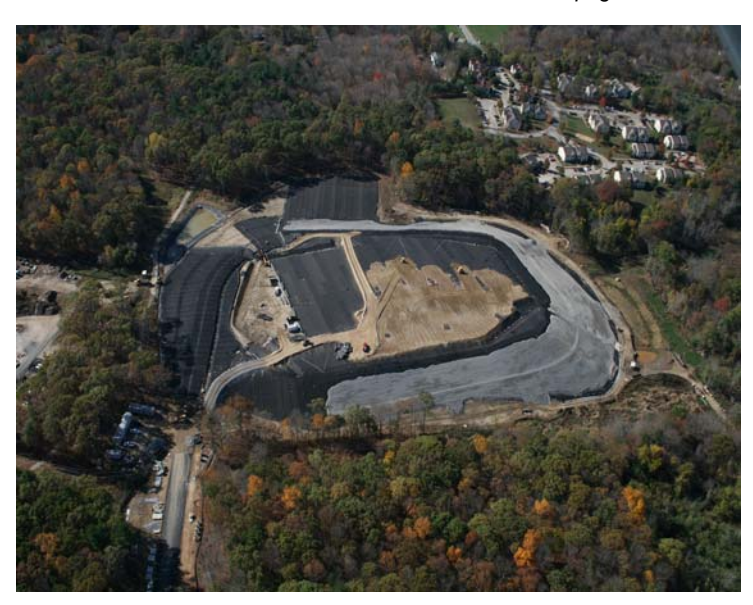
Landfill Closure 10-29-07 - Aerial View Looking East, Liner Installation