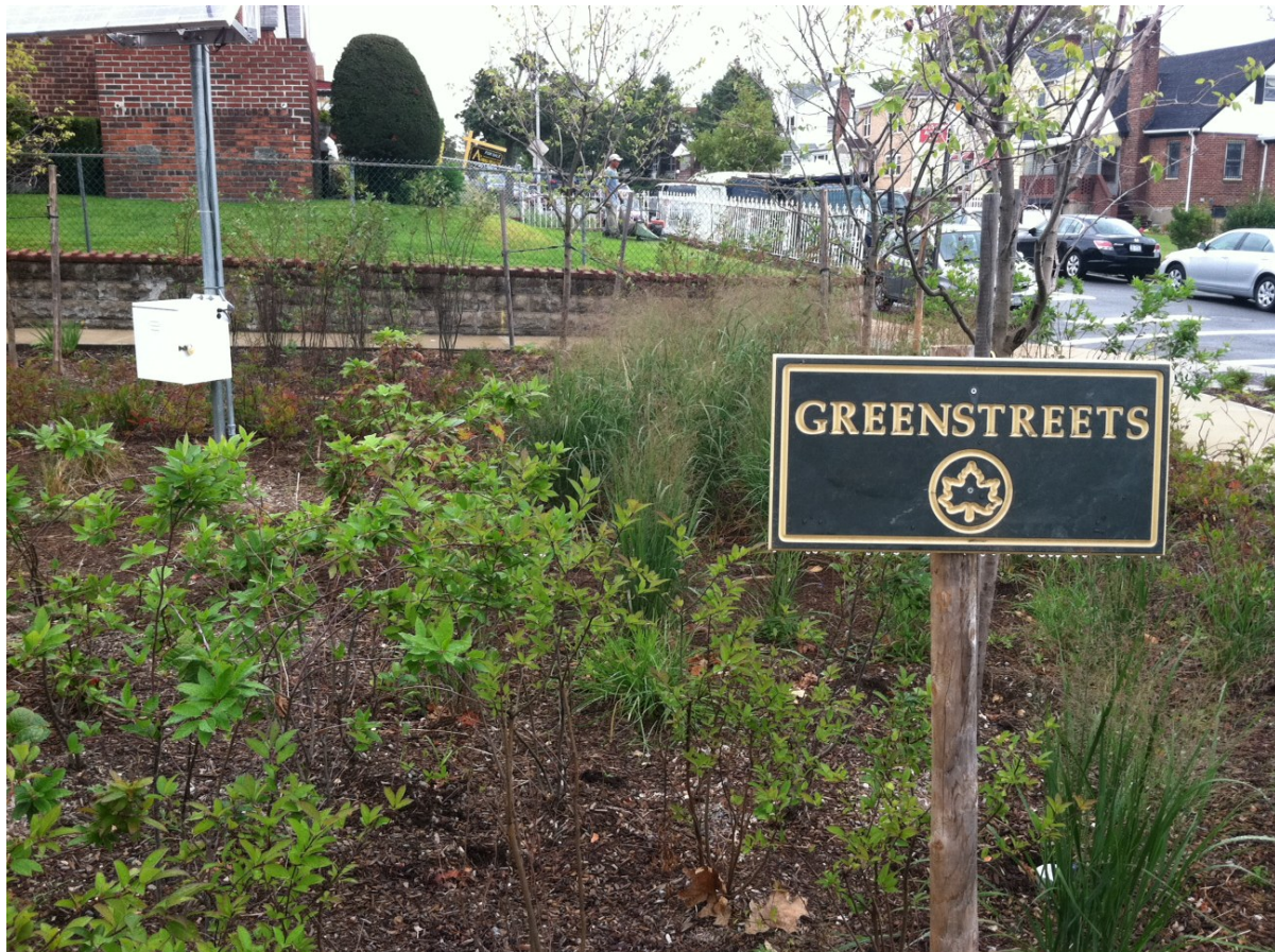
Stormwater bioretention area in Queens.

Green infrastructures, including bioretention areas, green roofs, installation of pervious pavement, addressing overpass downspouts, planting of street trees, and “daylighting” streams (uncovering historical waterways) are in place throughout the city. The City has also installed sensitive measurement equipment to track stormwater volumes, pollutant removal efficiencies, and evapotranspiration rates. They have also addressed design, economics, societal and maintenance issues within their “High Performance Landscape Guidelines.”