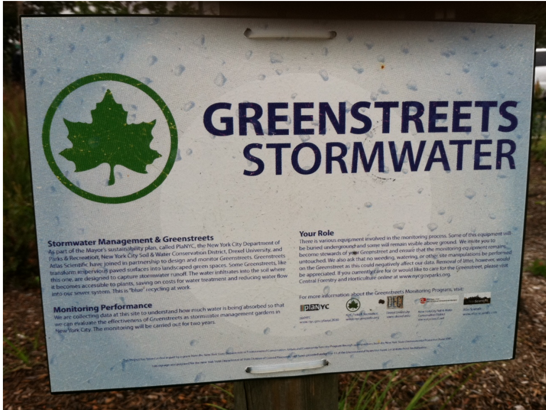
Signage gets the message out