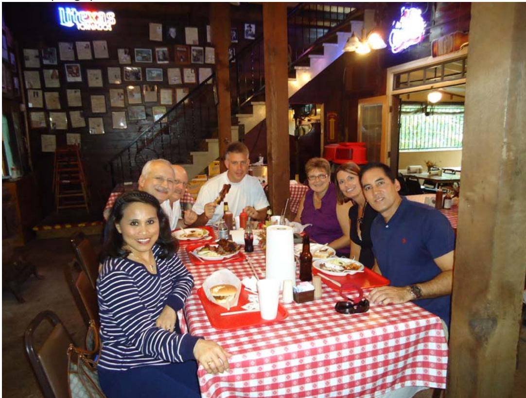
CTACHMM members are joined by Central Florida attendees for some local barbecue