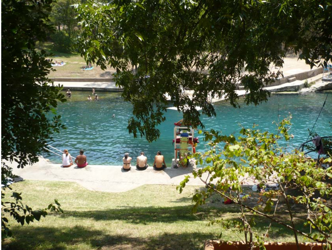
Barton Springs provided welcome relief from Austin's heat