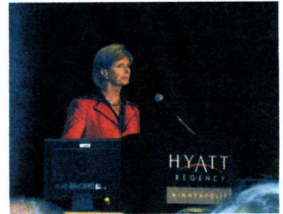
Former Governor and EPA Administrator Christie Todd Whitman gives the keynote address "Shaping the Future-America's Environment Today" at the National Conference

The conference was an outstanding venue for professional advancement, networking and continuing education.